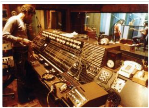
Original Record Plant LA Studio C