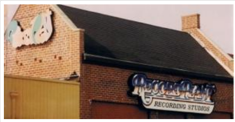
Original logo at left and new logo (circa 1978) original Record Plant location on Third Street, Los Angeles, CA