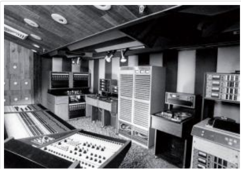
Record Plant NY